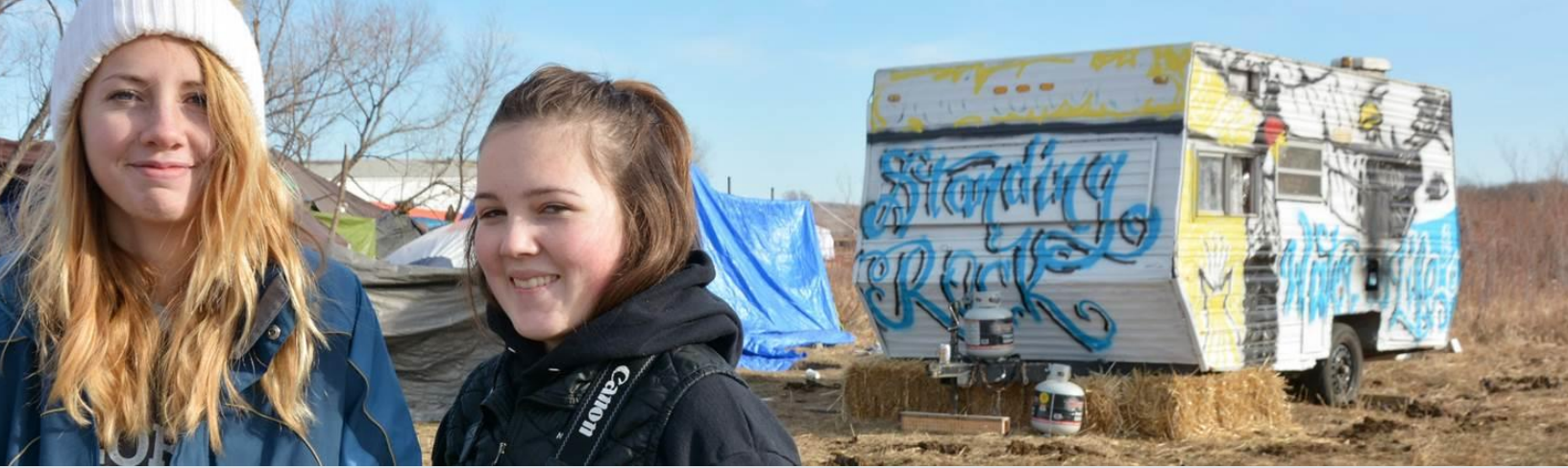
Here's a link to our slideshow from Standing Rock

Though it's too soon to know what the final outcome will be, we feel honored to have had the opportunity to stand with Standing Rock Sioux tribe in this struggle. We join them in praying that maybe, just maybe, for the first time in 200 years, the voices and the wisdom of the original Americans might be heard.